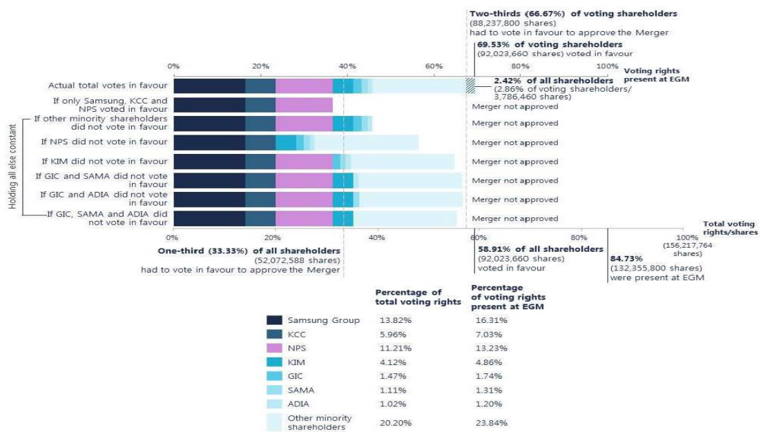
Figure 12: Diagrammatic representation of the voting required to approve the Merger